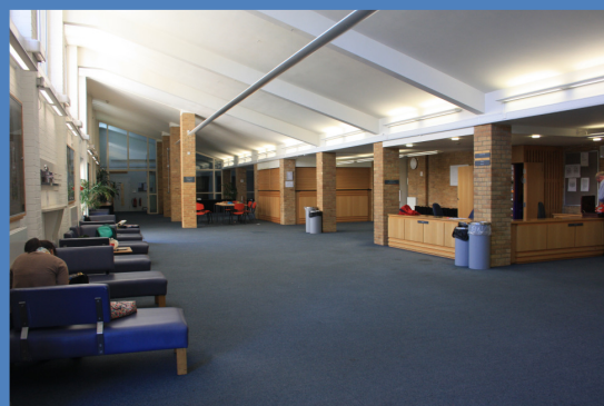
Music faculty foyer

I really liked the Music Faculty as well. The whole building is quite modern, built right next to the old music faculty building, which looks like a cute detached house and now houses the administration offices for the faculty. The library is a really nice, light space with a huge number and variety of resources, lovely staff, and an 'annex' where you can use keyboards with headphones and iMacs. The faculty doubles as a concert venue. As students you can access the Concert Hall (incidentally, where we do our exams, on the stage) and Recital Room, and the very nice pianos that live there. The foyer has a small coffee shop too, which is an absolute life-saver for morning lectures.