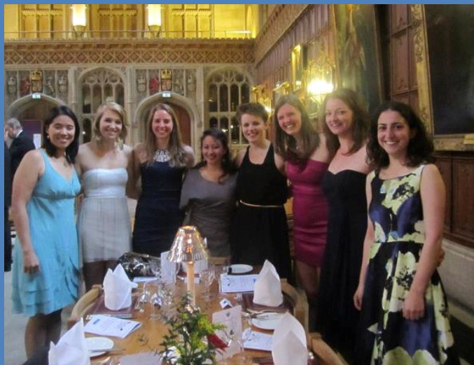
W1 crew at the May Bumps dinner (I'm second from right).

It was great for getting me out of bed in the morning, especially this year when I didn't really have lectures to get to, and while I was revising it was great for getting some headspace back, out in the open air and (hopefully!) the sun. The social side of the boat club is pretty spectacular too, and now that my leaving Cambridge is getting scarily close, I think this is one of the main things I'll miss.