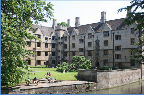
This year I live in Bodley's court

The lifestyle here is new and exciting but also made very comfortable. Accommodation is provided for the entirety of your time at King's, and the variety of places you can live is wonderful. Whatever your priorities, there will be something that suits you. Music students and choral scholars have a separate room ballot to the rest of the college, with special rooms reserved for us all over the college. Each one contains a piano which is tuned each term. On top of this, you can practise on the Steinway concert grand in Hall, the baby grand in Keynes Hall, or either of the basement practice room pianos.