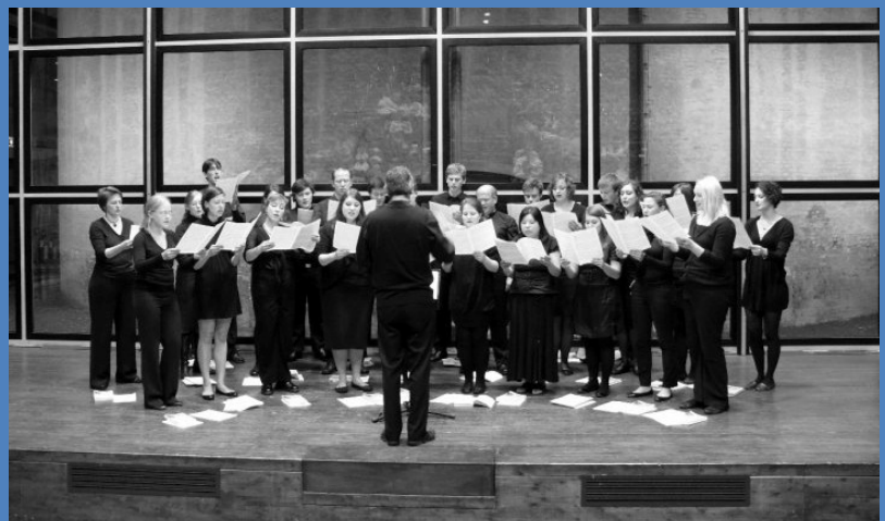
King's Voices in Bologna, Italy

I auditioned for King's Voices, just about managing to make a noise through all the nerves, and have been happily singing away in one of the most famous musical venues in Europe ever since, with a very nice and hugely varied group of people. I went on tour with them twice, once to Bologna and once to Malta. The choir I sang in at school did medleys from West End shows and pop covers, but King's Voices