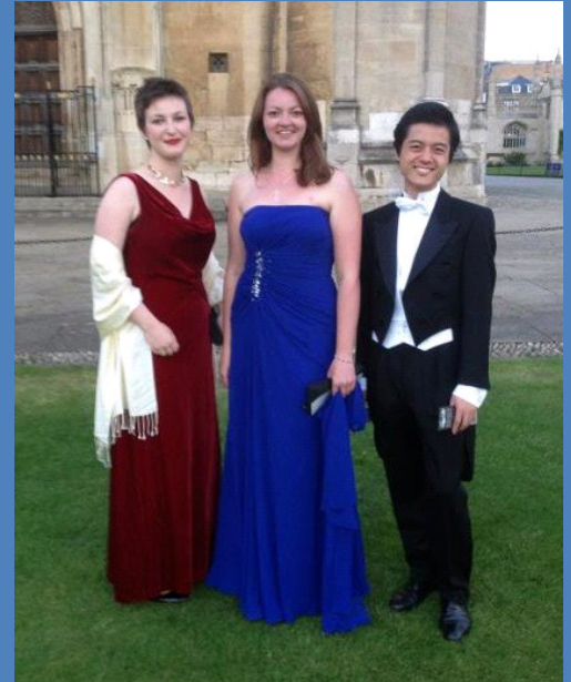
After the May Week Concert, we were on our way to Trinity May Ball.

My main extra-curricular musical activity has been King's College Music Society. I started doing odd-jobs in my first year, making posters, tickets and so on. In my second year I became Student President and was in charge of my own committee, organising large- and small-scale concerts in College. The aim was to get more people involved in making music, so on top of the big concerts that were expected of us, we started up a recital series as well as a Friday night slot which showcased some of the amazing bands that King's has floating around. I'd never done anything like it before and found myself making things up as I went along, as there wasn't anyone who'd done it before still around to help. This year I took more of a back seat as Secretary and guided a