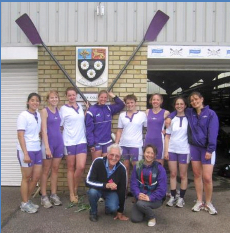
The W1 crew after the May Bumps races (I'm third from left).