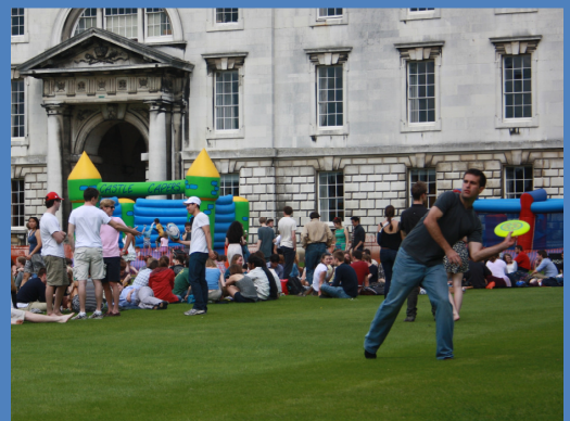
Annual Funday on the back lawn

It definitely takes some time to get to grips with your style and supervisors' expectations, but everyone is in the same boat, and there's the whole year to work it out.