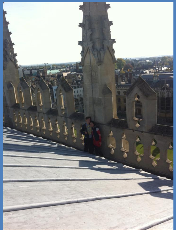
On King's Chapel roof

I remember the first essay I handed in. It was returned to me covered in red ink and I was slightly disheartened. However, re-reading that first essay later on, I was shocked that I ever turned in an essay of that standard! It is really amazing how quickly you develop skills and how