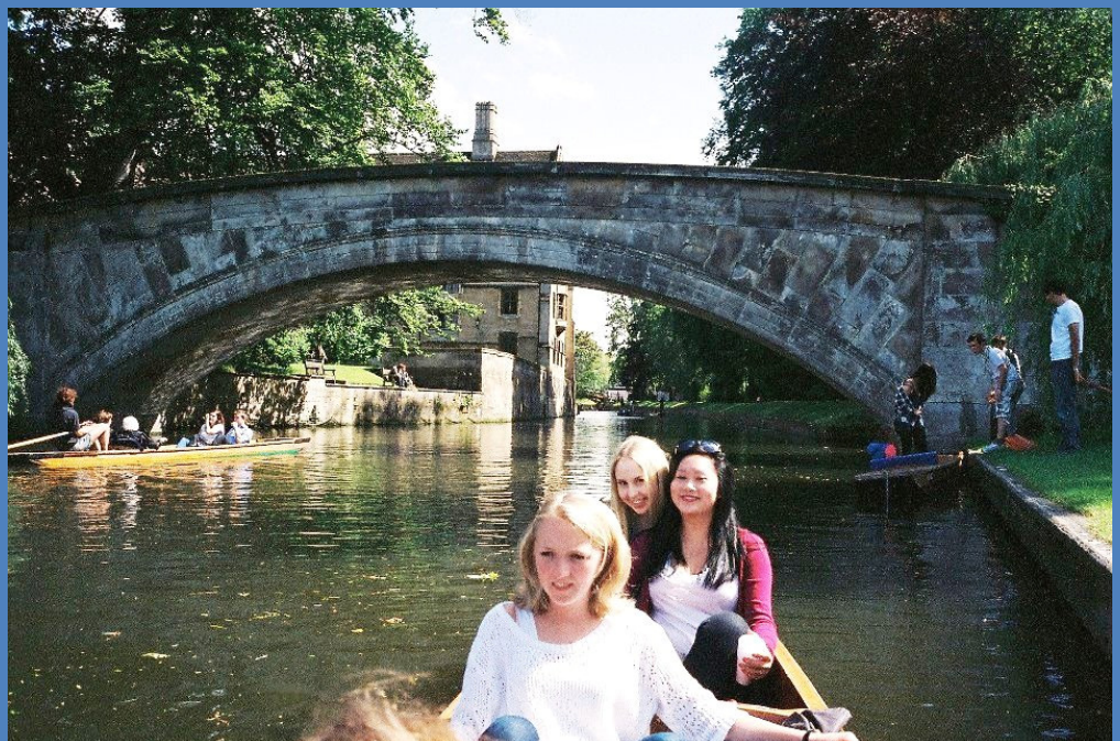
Using the King's punts

Another piece of advice for anyone starting is to make friends with those in the year above. The second years at King's were really helpful, recommending books or websites when I was struggling, or helping me with supervision work.