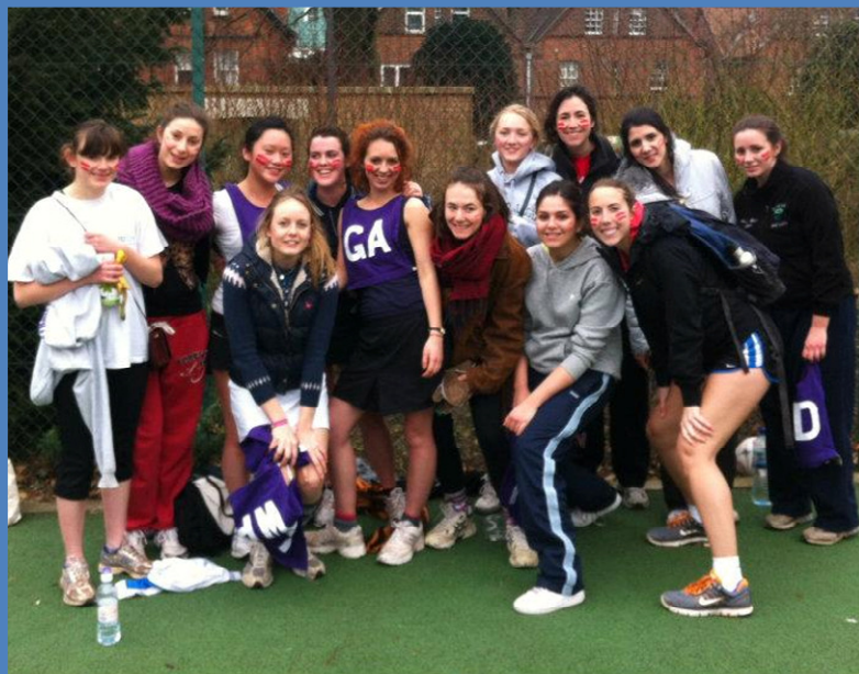
King's Ladies' Netball

I play in the ladies' netball team and will be the captain next year. We play once a week at the weekend, usually on a Sunday morning. There are matches against other college teams in the