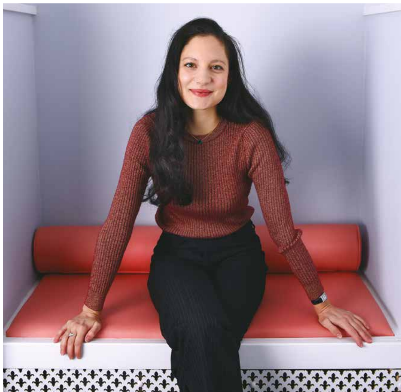
Photographed in the Turing Room, Gibbs Building

M y research focuses on the moral and legal responsibility of the self-deceiver. Self-deception is a critical topic in today's world yet remains unexplored in law. Using philosophy of mind, moral psychology, and the law, I propose a new model of self-deception and develop a framework to account for the responsibility of self-deceivers.