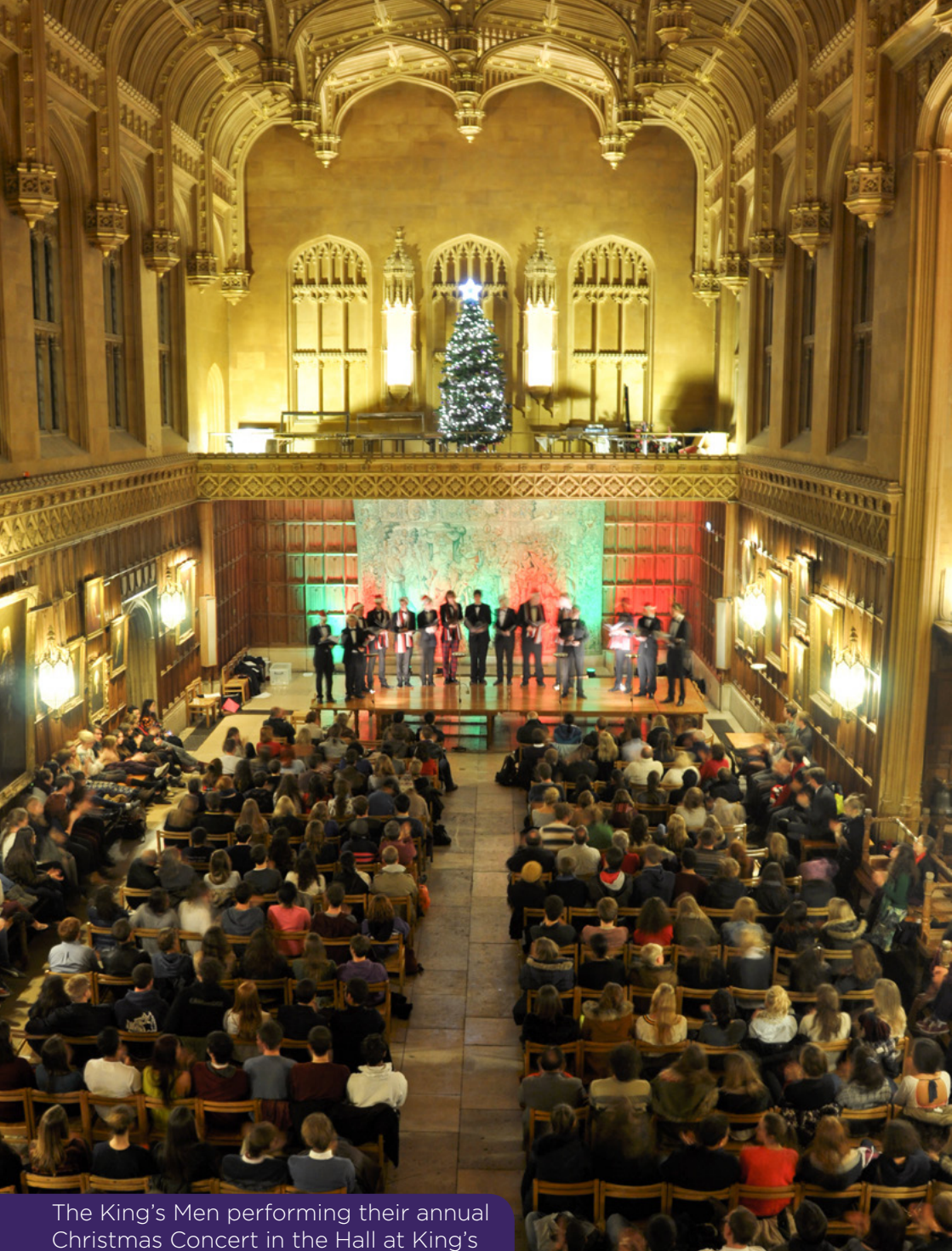
The King's Men performing their annual Christmas Concert in the Hall at King's