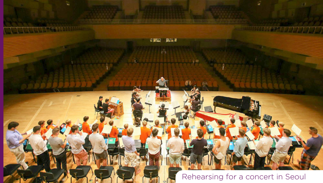
Rehearsing for a concert in Seoul

Millions of people listen to King's Choir – not just the visitors to Chapel and audiences at our international concerts – but also the tens of millions around the world who tune into the numerous radio and TV broadcasts every year, including the famous live Festival of Nine Lessons and Carols on Christmas Eve.