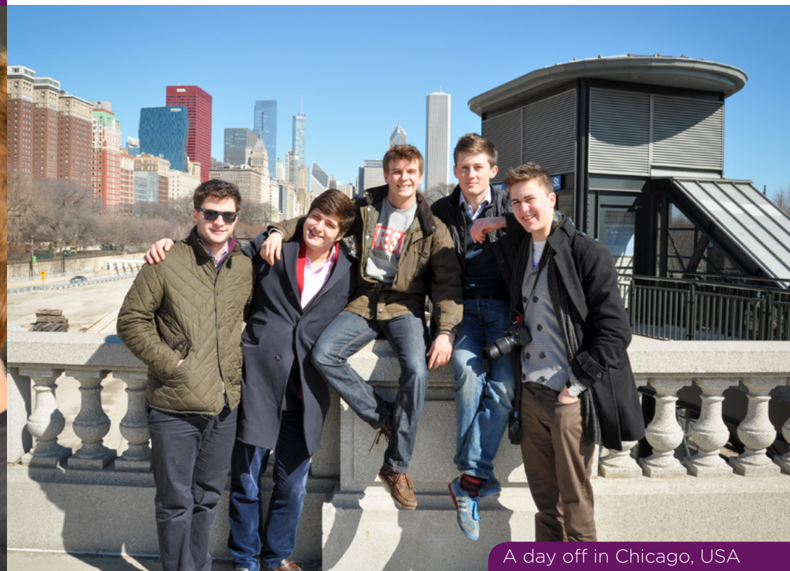
A day off in Chicago, USA

The amount of time spent with the Choir during the University vacations is limited to ensure that choral scholars get plenty of downtime, and while on tour the choral scholars have time to sightsee and take part in activities. Touring incurs no charge to choral scholars, who are paid for each concert performed.