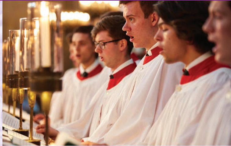
KING'S COLLEGE CHOIR (Kevin Leighton)

Good Friday 19 April 5.30pm [finish c.6.15pm]