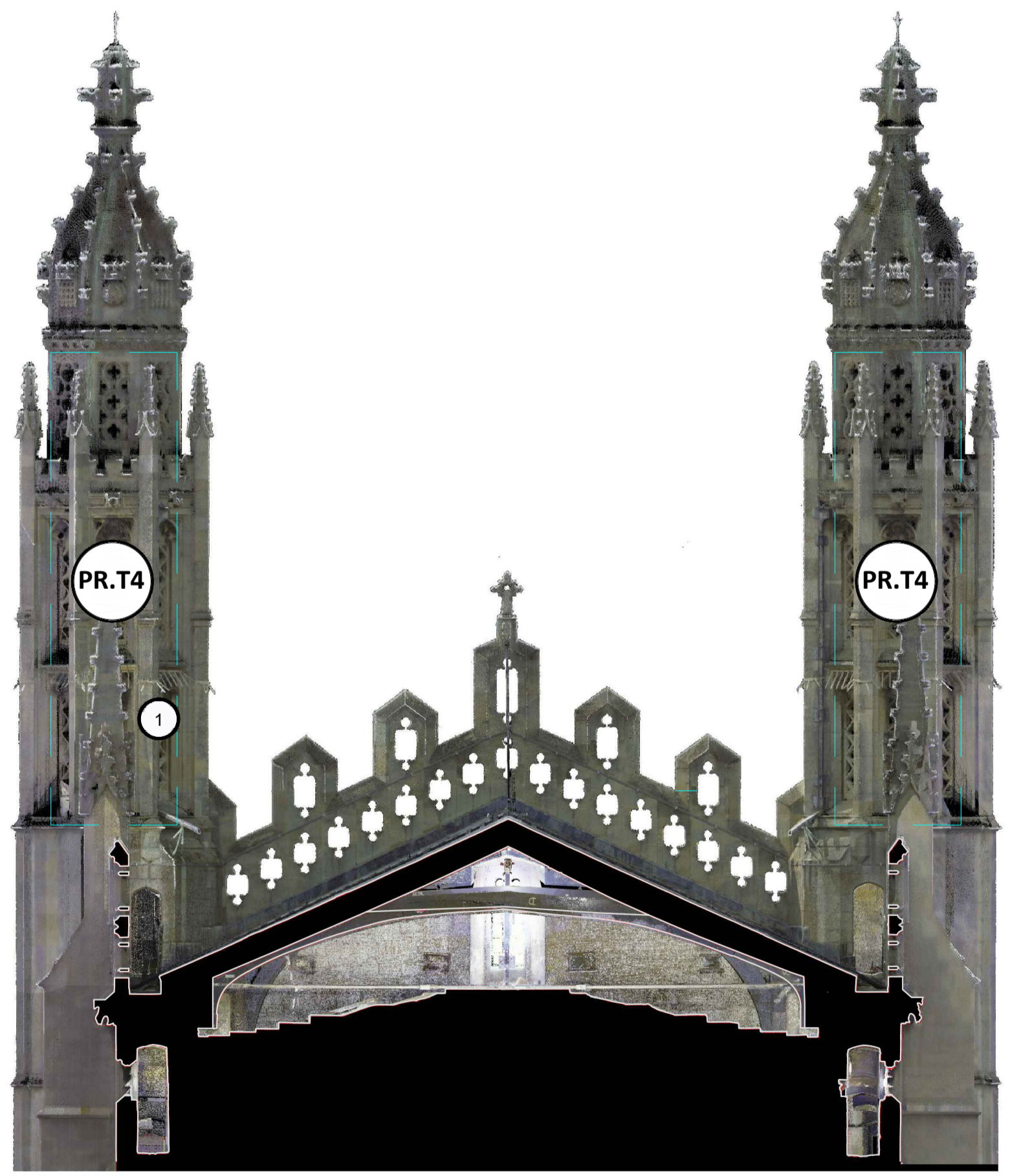
West Parapet, 1:100@A1