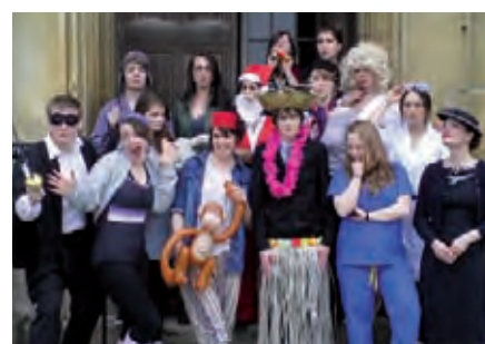
Last year's telephone fundraising team

The 2012 Telephone Fundraising Campaign (TFC) will take place 18 March to 1 April. Our team of student callers will be phoning around 1,000 Members and Friends to update them on College news, share their experiences of King's and inform them of the current Annual Fund effort.