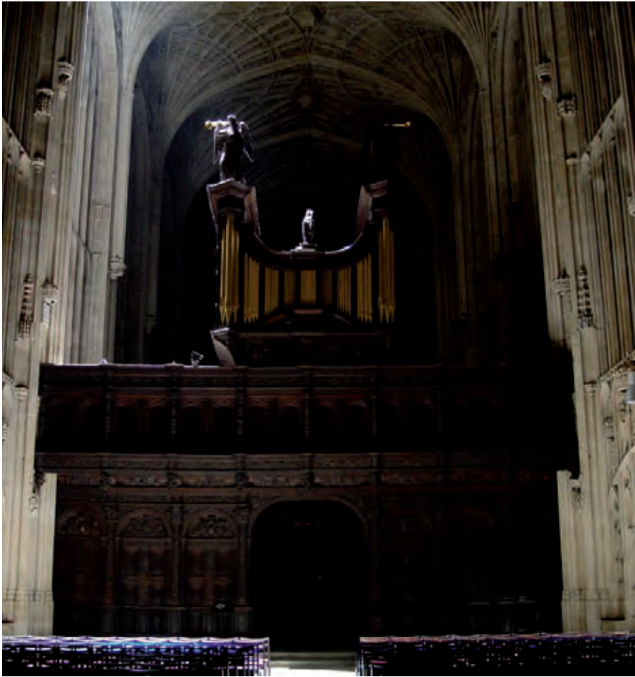
For decades, the lighting in the Ante-chapel has been less than ideal for musicians.

The students proposed an ingenious scheme for efficient light transmission, which was later embodied in a professional design by Roderick. With help from others, Roderick and Tom built and tested a prototype in the basement of G staircase. It was then installed in the Chapel where it has been demonstrated thirteen times for up to three hours. Visually, the illumination resembles sunlight but there is no significant risk to skin and eyes. Six units could provide