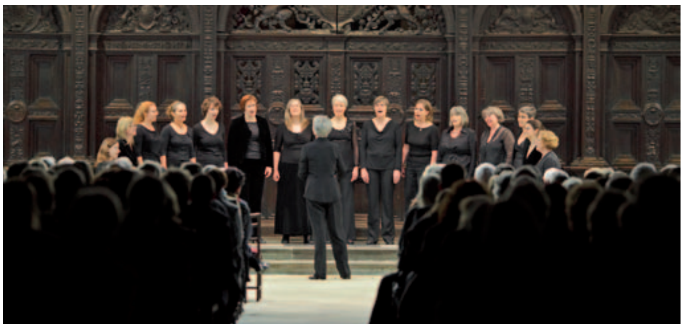
The Celebration of the Admission of Female Undergraduates. Top: Gala Dinner in the King's College Hall. Bottom: The Collaborative College Concert