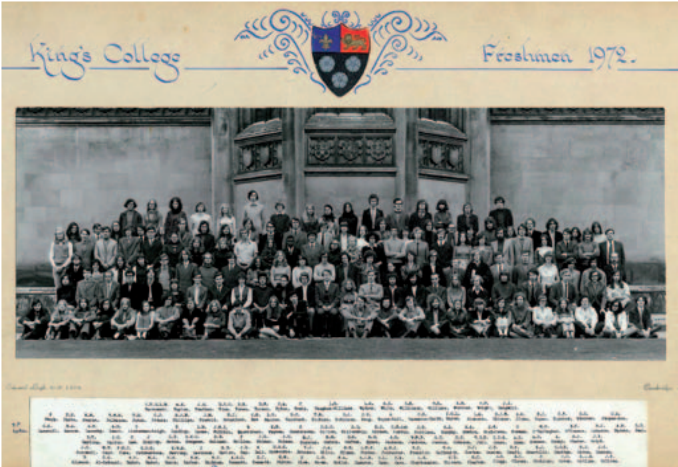
King's College Freshmen 1972