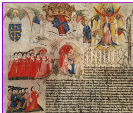
King's College Foundation Charter